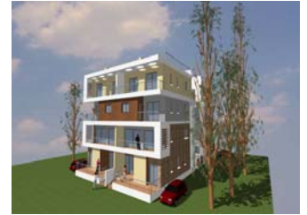
(Sample of the mezzonettes in XS C.P.I.)

The Fund has committed €1million in the form of a loan to its subsidiary XS Bulgaria Property Co that has undertaken the development of retail office space in the Residential Park Sofia (RPS). The project is located in the heart of the second face of Lindner's development (South Sofia) with a size of approximately 6,000sqm. Colliers International conducted a feasibility study of the project where they estimated the Net Present Value of the project at €2,069,196 (the calculation was carried out with the NPV method and by assuming a discount rate of 8.5% and a Terminal Cap Rate of 7.5%). The project is expected to be completed on May 2008.