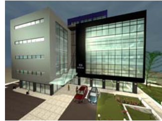
(The XS Building in Sofia)

The fund is currently invested in three projects as can be seen in figure 1. The first project is a commercial and retail block at the Residential Park Sofia which is fully owned by the fund. The other two investments are residential developments in Bucharest carried out through Limited Partnerships.